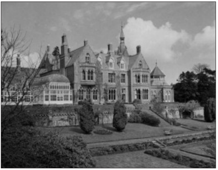
Hafodunos in 1954

For any building of importance it is essential that a fire-risk assessment by the local fire brigade should be in place in anticipation of a similar disaster. Conscientious owners will have undoubtedly thought of this and sought appropriate advice. But there is scope for concerned amenity groups such as