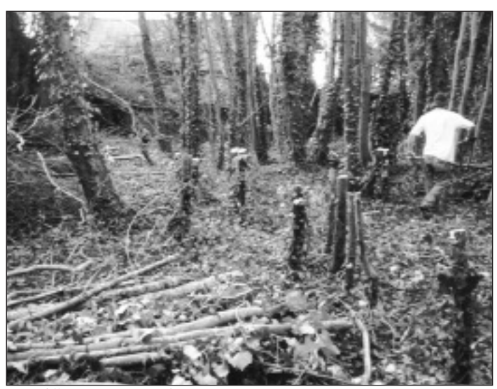
Tree felling in progress, February 2005

support which those involved in the project have worked hard to maintain while efforts to attract funding have been made. A substantial grant (over two years) has now been obtained from